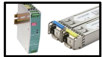
Optional: Power Supply / SFPs